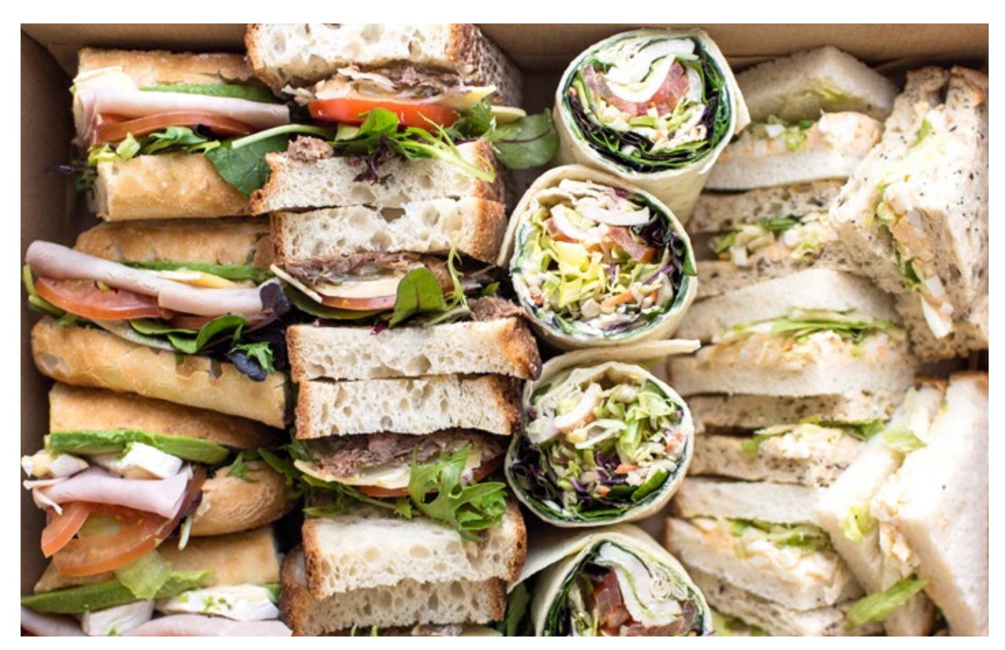
Mixed Sandwich Box